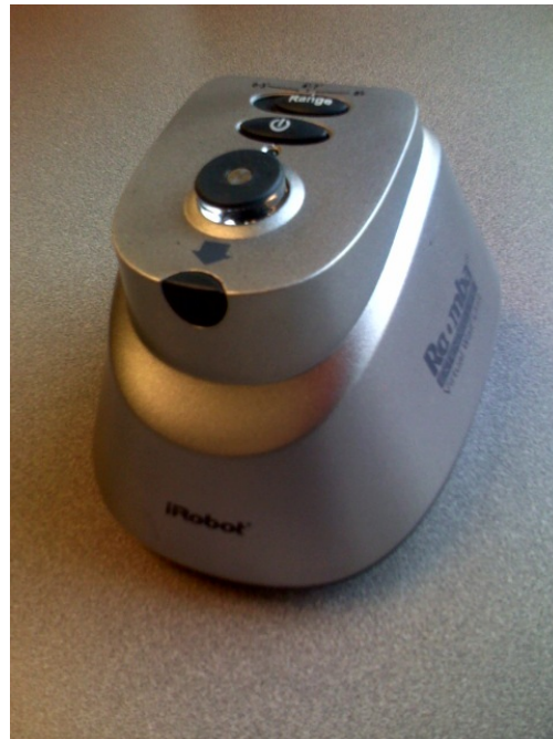
Figure 1: An iRobot Virtual Wall device emits an IR signal that can be received by the SmURV and provided to your client by Player’s IR proxy.

Virtual walls (pictured to the right) are devices that emit infrared (IR) light that can be received by the iRobot Create and Roomba platforms. The distribution of space covered by the emitted IR forms a beam that can extend up to 8 feet. These beams form an invisible barrier around the field that your robot should respect. Your control client will have access to the SmURV’s IR sensing through the IR proxy. Note that the width of the virtual wall’s beam also increases as its length increases, creating a cone-shaped area from the IR wall. It is best to set the range slider to the middle option: 4-7 feet. However, if you find the width of the beam emitted from the IR wall is interfering with your robot too much, the 0-3 feet range may be more appropriate.