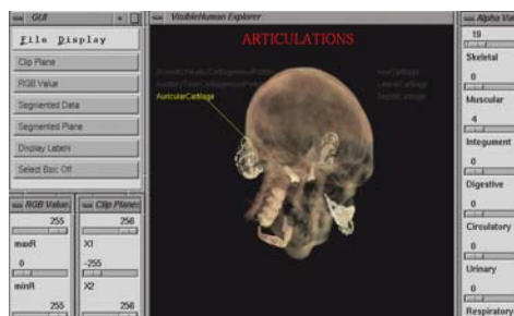
Figure 2. The desktop condition

To gain insight in the use of MPUI in VEs, we performed a usability study to compare three different setups: a Tablet with a traditional desktop using a 21" monitor (Figure 2), a Tablet with a large screen display, and an OSF/Motif style desktop environment. The large screen display was simulated using one wall in the Virginia Tech CAVE (size 10'x10'x10'). The goal lies in observing users' behavior and subjective responses to certain setup while performing search tasks. We tried to avoid the stereo mode in the CAVE